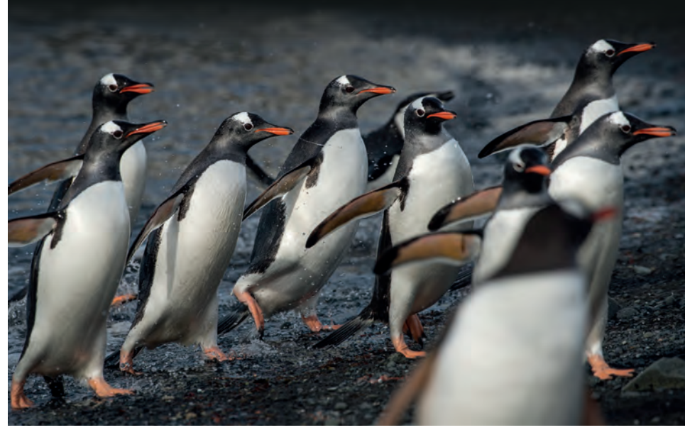
Here's a great early Christmas present. Up to 25 % off this Christmas' sailing exploring the best of the South Shetland Islands and Antarctic Peninsula. Sheltered bays and channels sparkle with ice and reflect towering snowy mountain peaks and immense glaciers. Icebergs complete an image of incomparable beauty. Waters